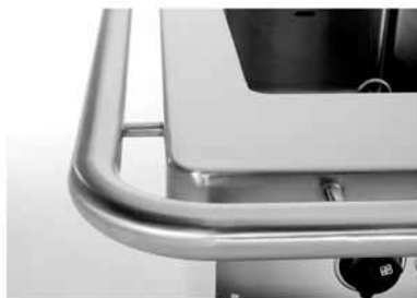
Top plate, 50° corner version