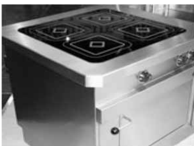
Top plate, 45° corner version